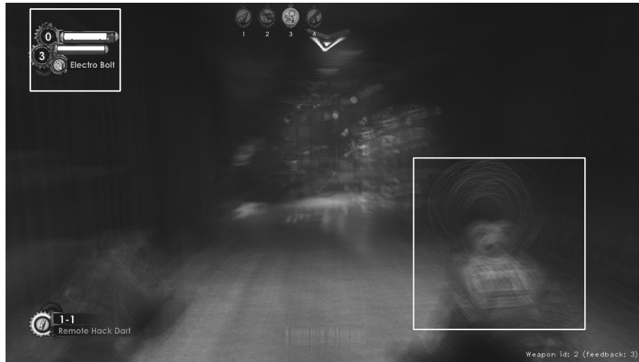
Fig. 5. Visual effect of the methods result: image from the average frame, the detected HUD area subjected to further analysis, and the identifier of the detected weapon in the lower right corner (processed frame from a screencast recorded from “Bioshock 2” [1]).

(shown in Fig. 5). The reason was the distinctive appearance of the weapon, which contained two circles. This caused a false positive to occur frequently.