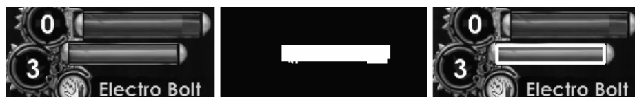
Fig. 3. Algorithm for detecting the value of the energy bar. From the left: The input area of the image detected by the classifier (additionally automatically cropped to improve processing); the image with detected pixels of proper shade and brightness (light blue); the output image with the outline of the energy bar marked, whose width is information about the energy possessed (fragments of processed frames from a screencast recorded from “Bioshock 2”[1]).

first aid kits (supplementing the character’s health), and the second – the number of portions of “Eve”, supplementing energy. The lower HUD of the game, in turn, presents information about the quantity and type of ammunition for the currently selected weapon. These values have a huge impact on the player’s tactics and tell a lot about his style.