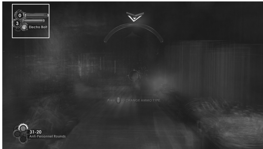
Fig. 1. The cascade classifier detects and marks the screen area containing the HUD (processed frame from a screencast recorded from “Bioshock 2” [1]).

HUD detection is performed using a properly trained cascade classifier based on Haar-like features. The classifier reliably detects a screen section with the same shape and the same HUD fragment (the cropping differences between subsequent detections are small). It is therefore possible to train the classifier so that it detects one very characteristic fragment of the HUD and then enlarges the marked area (e.g. in percentage) so that it contains the entire HUD (Fig. 1).