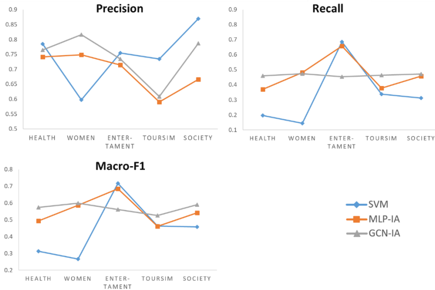
Fig. 2. The results of each interest class in 4# dataset.

The results of each interest class in 4# dataset are shown in Fig.2. The results show that GCN-IA performs stably in all interest profiles, which demonstrate the good robustness of our model.