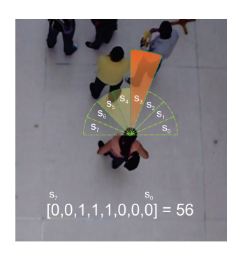
Fig. 2. The space around the agent is divided into eight regions of radius r. The occupied regions establish the obstacle code \varphi .

The set of features v, \sigma, \varphi, A_x, A_y define a state vector S (see Eq. 12). In this case A_x and A_y forms a 2D the vector defining the motion performed by the pedestrian provides a certain state. All the vectors S which match the same goal goal_k are packed in a look-up table A_m see Eq. 13.