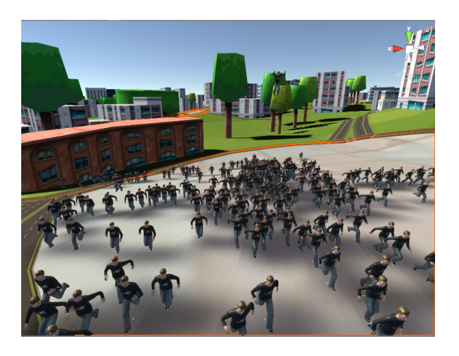
Fig. 4. An example of the system running with the described specs.

For our experiments we executed the simulation and visualization process in a workstation with these characteristics: Intel Core i7-4810MQ CPU @ 2.80GHz 8, 16Gb of RAM, GeForce 880M with Gb of video memory. For a simulation in the city (Barcelona) with one thousand characters 4.3 million triangles are needed and 3.1 million vertices. We use 1115 draw calls and 39 batched draw calls. It takes a total of 300 megabytes of RAM memory, 112 megabytes of video memory and it takes 28 milliseconds to render each individual frame giving us a 35.71 frame rate. In average each frame has 18000 objects and the total scene is composed by 42767 objects as shown in figure 4.