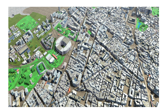
Fig. 1. Urban environment created using real data.

example of an environment that uses visualization and level of detail techniques in order to have urban scenarios with crowds composed by hundreds of thousands of varied animated characters running at interactive frame rates without compromising visual quality [24].